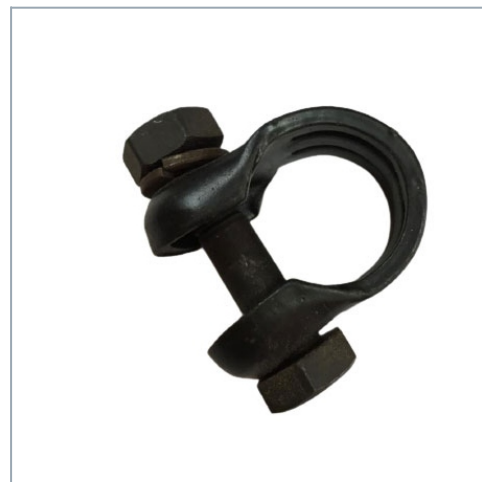
TIE ROD CLUMP