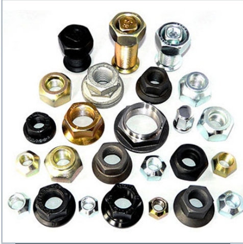
ALL TYPES OF NUTS