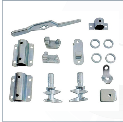
CONTAINER DOOR LOCK SET